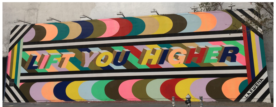
LAKWENA, LIFT YOU HIGHER, 2017