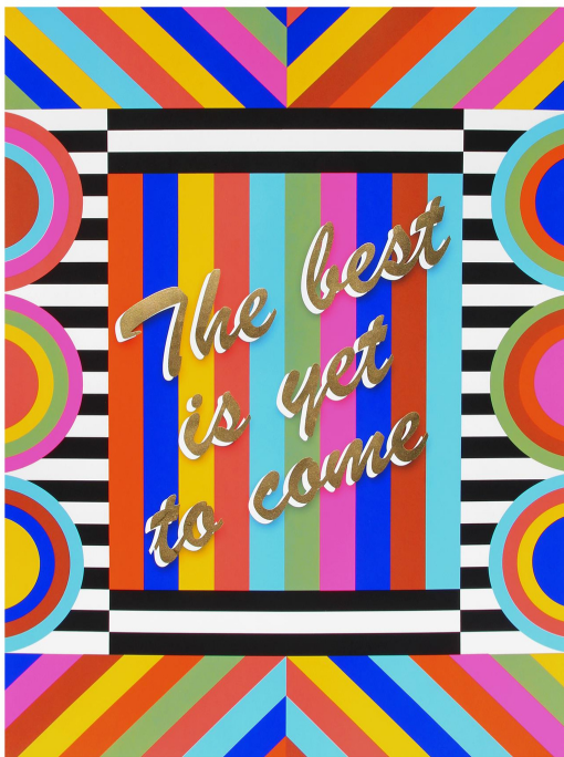
LAKWENA, THE BEST IS YET TO COME, 2018