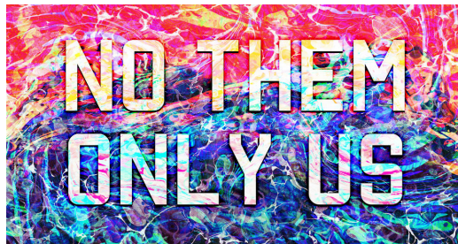
MARK TITCHNER, NO THEM ONLY US, 2016

IF YOU CHOOSE, YOU CAN ADD YOUR OWN PAINTED OR DRAWN ELEMENTS TO YOUR BACKGROUND