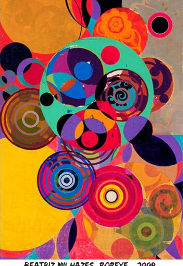
BEATRIZ MILHAZES, POPEYE, 2008