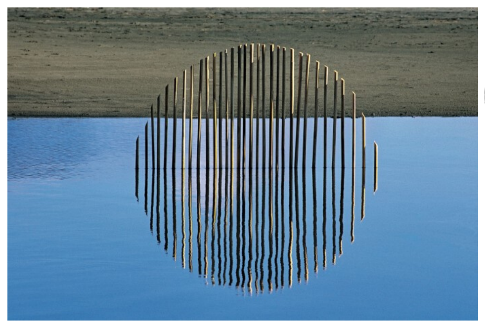
MARTIN HILL, WATER CYCLE 3, TOETOE STICKS, NEW ZEALAND, 1997 www.atthebus.org.uk