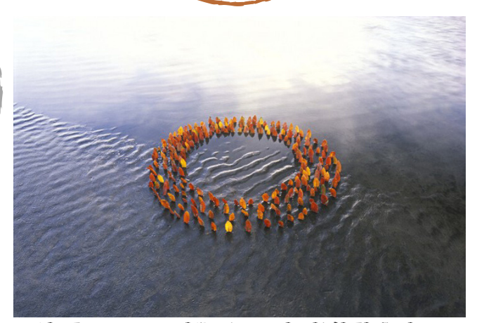
MARTIN HILL, LEAF CYCLE, ANAWATA BEACH, 2002