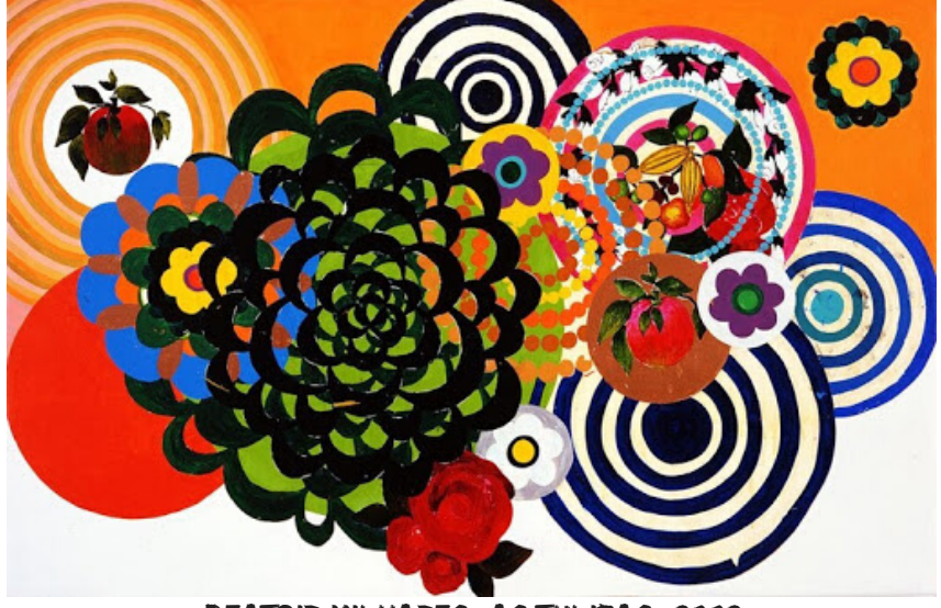
BEATRIZ MILHAZES, AS TULIPAS, 2002