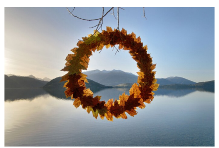
MARTIN HILL, AUTUMN LEAF CIRCLE, 2008