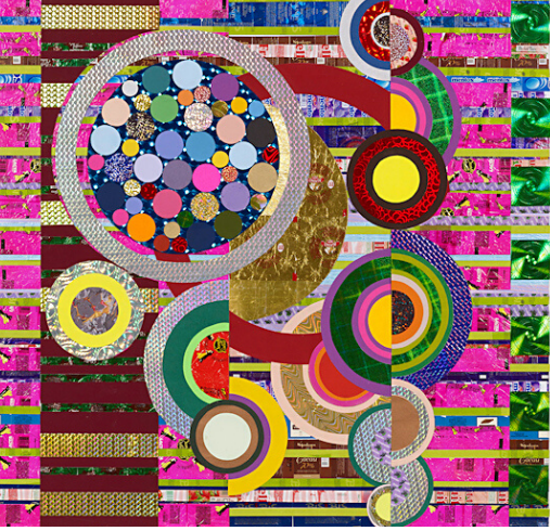
BEATRIZ MILHAZES, CACAU, 2011

You could use collage, paint, pens or pencil.