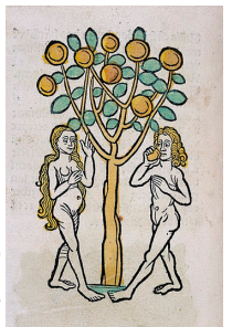
ADAM AND EVE UNDER THE TREE OF LIFE, WOODCUT, 1547

Apples represent temptation in the Garden of Eden. What is most tempting for you?