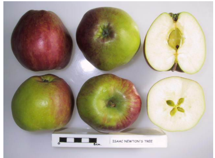
CROSS SECTION OF APPLES FROM ISAAC NEWTON'S TREE, NATIONAL FRUIT COLLECTION

It is believed that, in 1665 or 1666, Newton observed an apple falling from a tree and began pondering the forces that govern such motion.