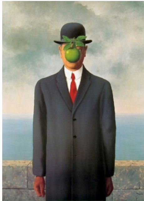
RENÉ MAGRITTE, THE SON OF MAN, 1964

What happens to this real apple over time when it is displayed?