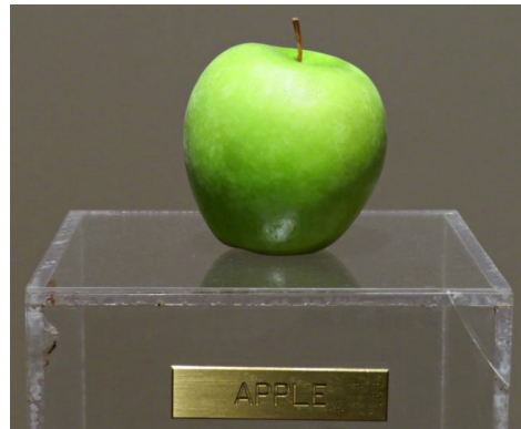
YOKO ONO, APPLE, 1966

What happens to this real apple over time when it is displayed?