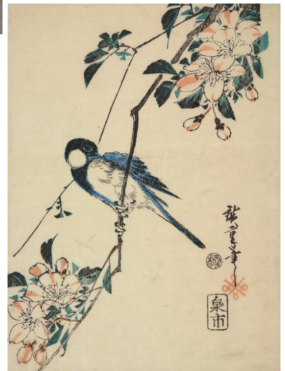
UTAGAWA HIROSHIGE, GREAT TITMOUSE ON A CRAB APPLE BRANCH, 1830-1835

Apples represent temptation in the Garden of Eden. What is most tempting for you?