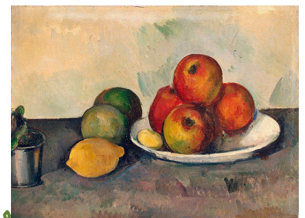
PAUL CÉZANNE, STILL LIFE WITH APPLES, C.1890