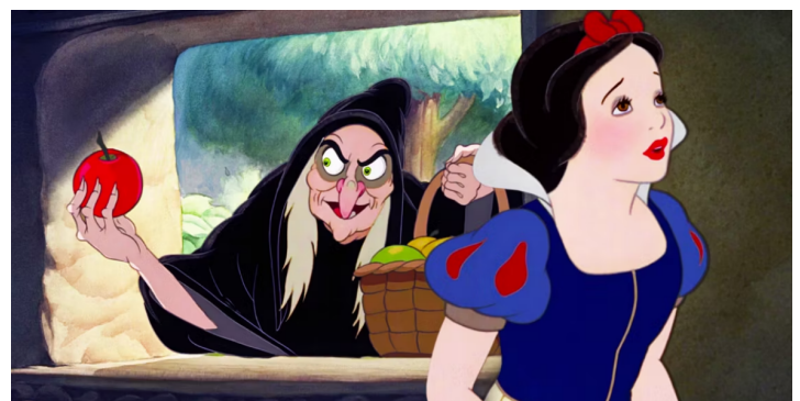
SNOW WHITE AND THE SEVEN DWARFS, DISNEY, 1937