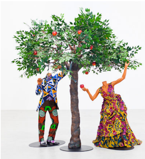
YINKA SHONIBARE, ADAM AND EVE, 2013

Each blossom on the apple tree becomes a fruit. Have you ever looked closely at the flowers?